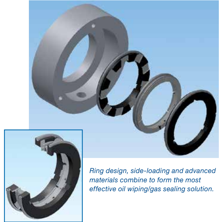
Ring design, side-loading and advanced materials combine to form the most effective oil wiping/gas sealing solution.

RTV packing is available in many of the most common groove sizes, making retrofits an easy process that usually requires no modification of the case.