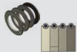
Low-Emissions rod ring styles