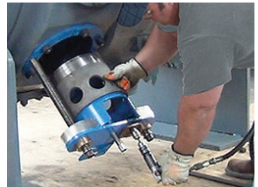
Drill moving assembly into valve port