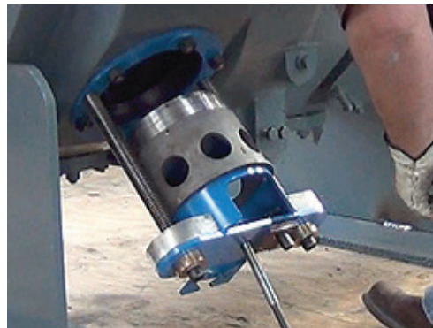
Valve, cage and gasket in V.I.T.